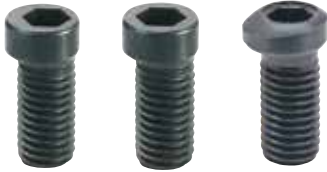
MBCS 04,16 MBCS 06~10 MBCS 12